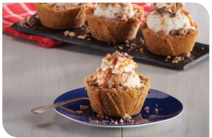
Caramel Peanut Butter Pies made with BabyRuth*

BabyRuth® is a delicious delight of smooth nougat topped with layers of rich caramel and dry-roasted peanuts, all covered in a chocolaty coating that is a fan favorite. BabyRuth® minis or chopped pieces are a terrific addition to any dessert.