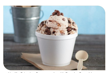
Vanilla Crisp Ice Cream made with Buncha Crunch*

CRUNCH® is a classic creation that combines 100% milk chocolate and crisped rice. Add CRUNCH® bar pieces or Buncha Crunch® to recipes as a topper on any dessert and watch your customer smile.